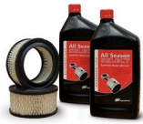
Small Reciprocating Start-Up Kits