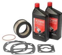
Small Reciprocating Maintenance Kits